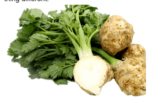
Celeriac – also known as "turnip-rooted celery"

Last month I brought home the seed boxes after our Club meeting, and I was asked to do a stock-take in preparation for the ordering of the new season's seeds. One of the things that I found interesting was that there were a number of packets left of two types of vegetable seeds – many of the other seeds were down to their last two or three packets. This made me wonder why – and then I realized that I didn't know how to grow (or cook) either of these two vegies. And maybe other members didn't either - so I decided this was a good chance to learn about growing something different.