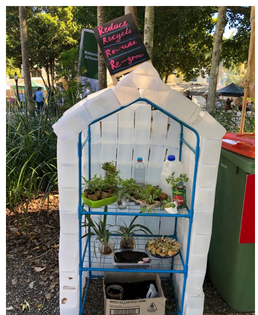
Gary and Eddie - green thumbs up!