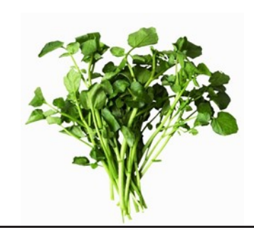
The delicate leaves of watercress

So – two lesser known vegetables – but perhaps two new items to add to your garden and your meals. Try some watercress now, and remember to grow some celeriac next autumn – experimenting is always fun!