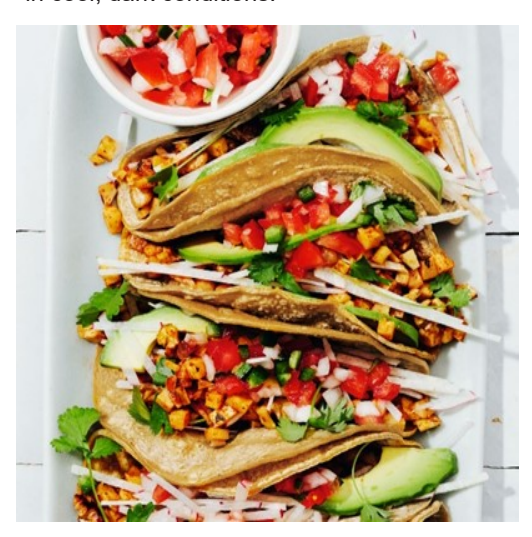
Walnut and celeriac tacos – they look yummy!

Celeriac grows best in cool and temperate climates as it develops its most intense flavour after exposure to frost. But it can be grown in the sub-tropics during the dry season. So you will need to wait till around Easter next year to try planting celeriac. But give it a go – there are plenty of recipes to enjoy; it is quite an easy plant to grow; it is a relatively pest-free vegetable; and the bulbs store well in cool. dark conditions.