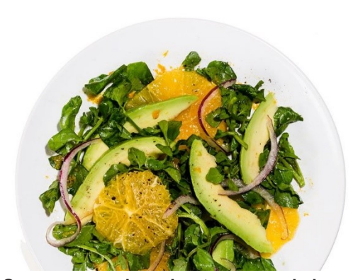
Orange, avocado and watercress salad