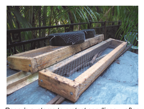
Roger's systems to protect seedlings – after seeing the greens growing in the vege patch, they obviously work!

There were four bee-hives along the fenceline – Roger has been keeping bees for about 30 years, and is very observant about what trees and bushes are flowering in the adjacent streets and gardens, and what is impacting the flavour of the honey produced.