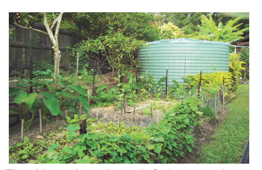
The side garden – the tank, fruit trees and vegetables.

I was particularly interested in Roger's seasonal gardening – in summer he grows Asian vegetables – kang kong, amaranth, Vietnamese mint, okra, wet season spinaches and sweet potatoes. Then, in winter and spring, he switches back to European vegetables. Anything that doesn't grow well in the environment is removed, and something more suitable planted. As Roger says, "failures are learning experiences, and so we move on".