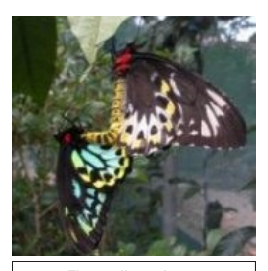
The smaller and more colourful male is on the left and the larger female is on the right.

It's best to plant as many of these vines as you can as each mumma butterfly will only lay one egg per vine, thinking she's giving the baby caterpillars the best chance of having a good food source.