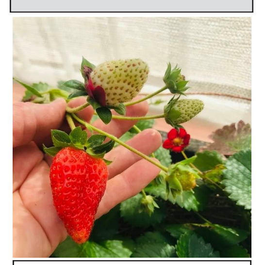
Melanie Strang is enjoying these beautiful organically grown berries. She grew the strawberries on her balcony garden and the native Atherton raspberries at her community garden plot. Yummy!