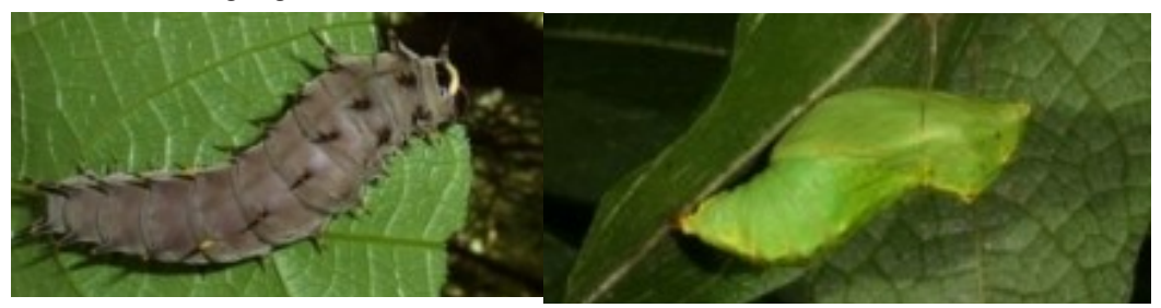
A Richmond Birdwing Caterpillar (left) and chrysalis (right).

As we already know, only one or two out of every 100 eggs will develop into a butterfly, so the odds aren't good. If you have some room on a fence, trellis or some tree trunks you can grow this vine up, plant as many as you can. This is traditionally a rainforest plant but I have successfully grown it in a sunny spot in Elanora. So if you have a spare spot why not plant some vines at your place and together we can help support this beautiful species. Michelle's Native Plants often has the vines in stock.